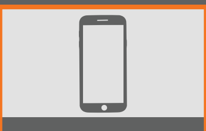
Nationwide, there are more than 20,000 phone calls placed to domestic violence hotlines daily.

Domestic victimization is correlated with a higher rate of depression and suicidal behavior.